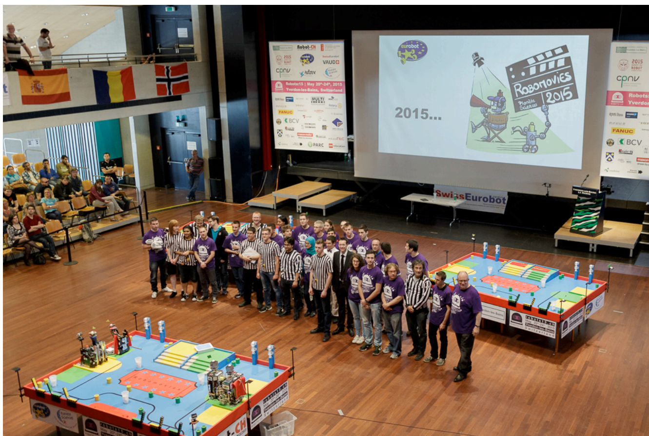
Fig.1 Some of the volunteers for Eurobot and Robots15 event

The first one is to recognize all the volunteers who have made this event possible. And for this purpose, I am calling all of them on the scene. (Fig.1).