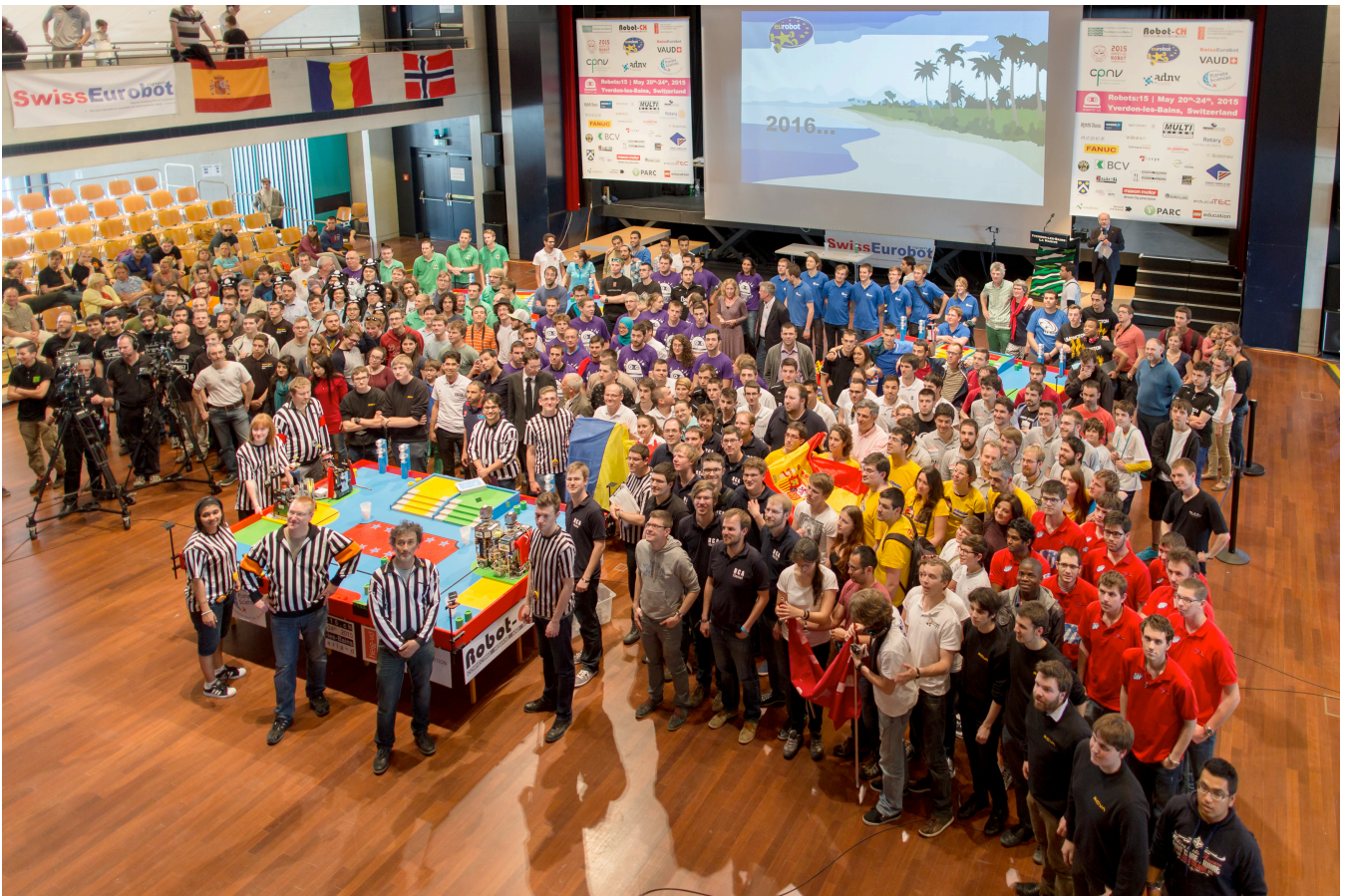
Fig.2 Some of the supporters for Eurobot and Robots15 event

And then will be the finals Thanks for your attention.